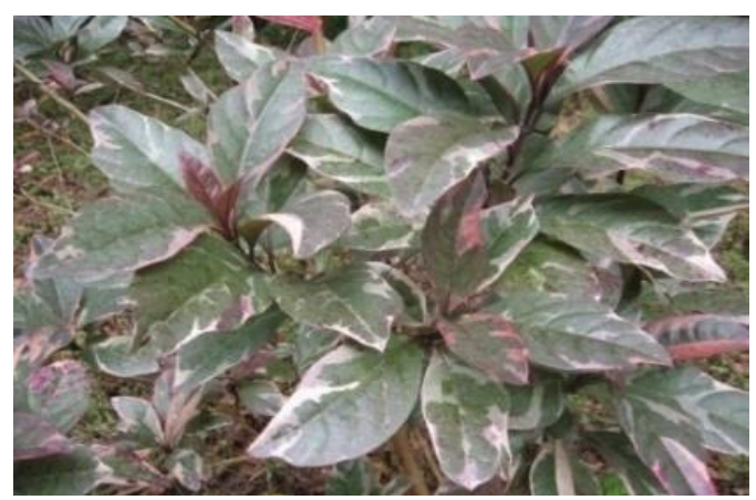
Fig 4. Arenthrmum Leaves