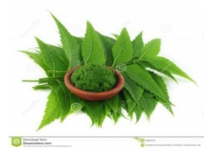
Fig 1. Neem Leaves