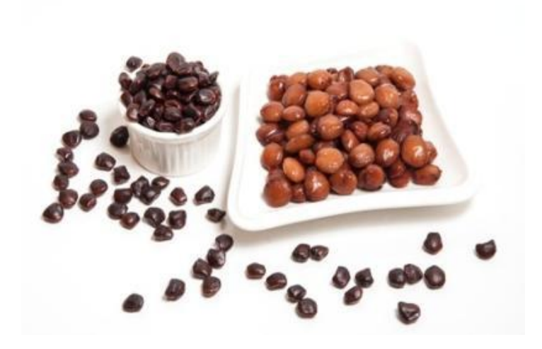
Fig 2. Tamarind Seeds