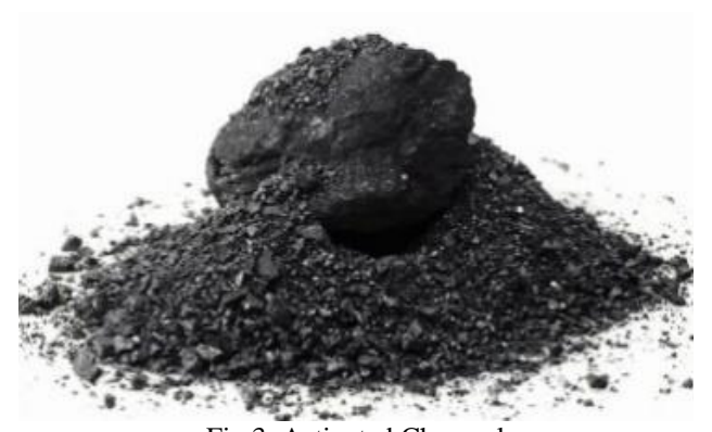
Fig 3. Activated Charcoal